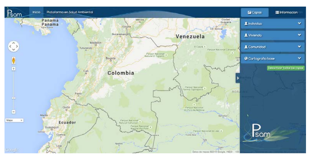
Figure 4. Layers in P- SAM