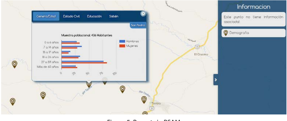
Figure 5. Reports in PSAM

The Geographical Data Mining Module (MMDG for its initials in spanish) uses a model that allows estimating or predicting the appearance of H. pylori with an estimated precision of 68 %. This model was created using data obtained from the community of the municipality of Timbío. The prediction model was built using decision trees J48 implementation of Weka [15]. The selected attributes were: name of the aqueduct, social stratum (high, medium, medium-low, low), basic sanitation (yes/no), water treatment (yes/no), overcrowded home (high, medium, low), pet (yes/no). The graphic interface of the module is shown in figure 6. This Graphical User Interface (GUI) was developed using Java Server Faces and PostgreSQL.