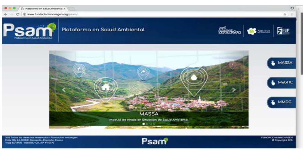
Figure 2. Main Page of PSAM platform

P-Mobile offers the possibility of managing surveys and allows creating new questions and possible answers. Surveys are designed by an administrator and can be answered from a mobile device. With P-Mobile, surveys can be configured and downloaded to mobile devices in order to collect data in the selected field. Also, the survey can be printed to be collected manually (figure 3). The collected information is synchronized with the database. P-Mobile Client was developed using Java Android, and the Web administration page was developed using Java Spring.